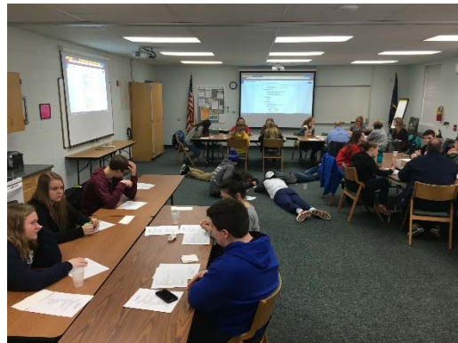
Planning for 2018-19 Event

This year the event was held on February 6, and our theme was "Inclusivity for ALL Kids." Lunch was served by our Career Center team--excellent food! We are already making plans for next year, with a theme of "The Improvement Movement." The students have elected two new student moderators, and we are working on scheduling our guest speaker. The students are making some significant changes to the program and are searching for new ways to bring their learning back to their home schools. The intent is to impact all students rather than just those who attend the main event. Our last meeting was exciting for the advisors and the students involved.