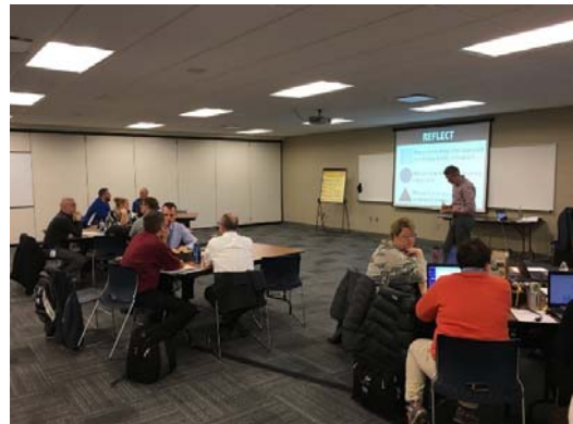
5-D training with local and ISD administration