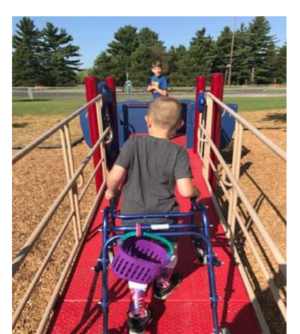
All our friends can get to the "Pirate Ship."