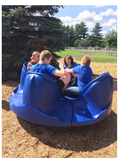
Middle school students enjoy spinning around.