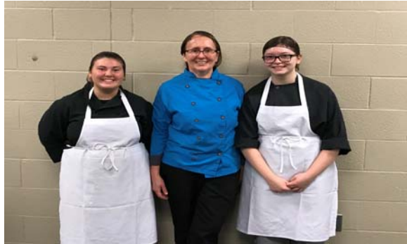
The Outstanding Culinary Crew!