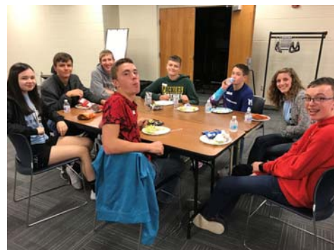
Local Students Enjoying Lunch Time