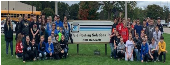
MS 8 th -graders at Fluid Routing Solutions

Later in the month, MOISD 10 th -graders visited the Career Center and toured three programs aligned to their career interests. Whether or not these 10 th graders decide to attend the Career Center next year, this Career Exploration activity is an integral part of their career development. The information they gleaned from these experiences will undoubtedly assist them as they update their educational development plans (EDP) and make decisions about what comes after high school. Additionally, these students will be able to visit the MOCC on a future date to experience a day-in-the-life of a Career Center student if they are still unsure if one of our programs is the right choice for them.