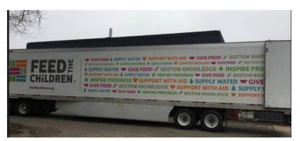
Thanks for your continued support!

May 15 is the End of the Year Carnival at Eastwood for all our GSRP programs and all programs at Eastwood. If you are available anytime from 10-2, come on out and enjoy the fun! MOCC students from Public Safety secure our perimeter, preventing and escapees and intruders from spoiling our fun. They also help manage parking and bus drop-offs and pick-ups! The Cosmetology students help out with face painting and hair decorating-come get a purple glitter star on your head! There will be a bounce house, picnic fare, and many other fun games and activities for all who attend. Come join us!