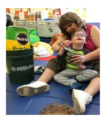
A student is planting Sunflower seeds.

The 4<sup>th</sup> Annual SCI-I Plant Sale will be taking place on Friday, May 17 from 8:30 – noon and Saturday, May 18, 10:00 am – 2:00 pm. at the main entrance of the MOEC.