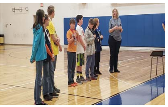
Morley students-showcasing their medals

Poisonous Maze was only "lethal" if the team's robot touched the sides of the maze. Students created block codes in order to control and guide their robot through the maze, knock over pins, and find the exit. Points were awarded as each of the challenges were completed. Bulldozing Energy Cubes allowed the teams to create a code that guided their robot to autonomously push "energy cubes" into containment areas. Students used their analysis of the playing field and prototyping to push the maximum number of cubes from one location to another in order to earn points for their efforts.