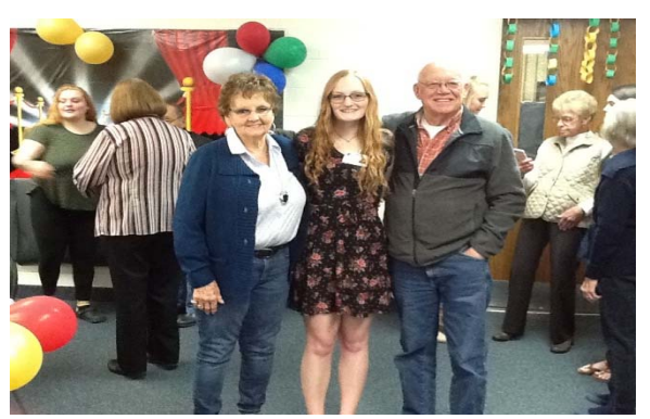
Grandparents' Day was a huge success!

and teaches me how to take care of his grandma."