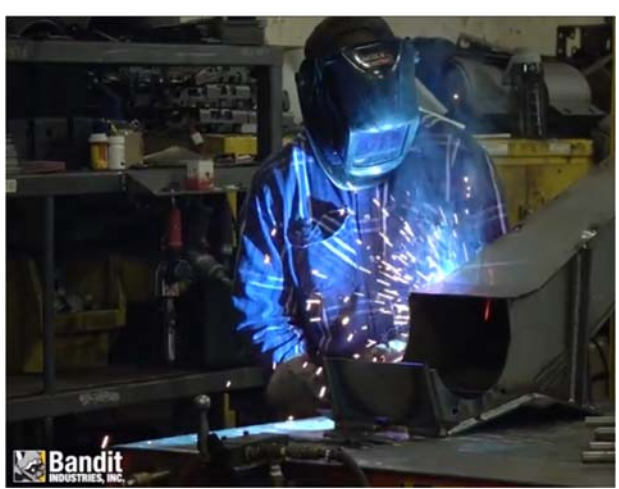
A student from Chippewa Hills will begin working full-time at Bandit Industries upon graduation

Students in long term work-based learning positions for pay are up 62% from last year. While this is only 13 students, three of those have been offered and accepted full-time positions upon graduation: one with Bandit Industries in Remus and two with Morbark in Winn.