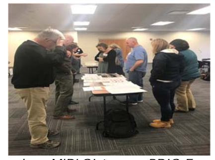
Secondary MiBLSI teams-PBIS Examples

The Gen Ed team works to find ways to provide ongoing support and learning opportunities that align with the MOISD goals.